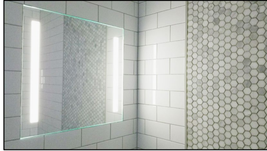
Figure 4. Grout around the mirror to seal and finish.